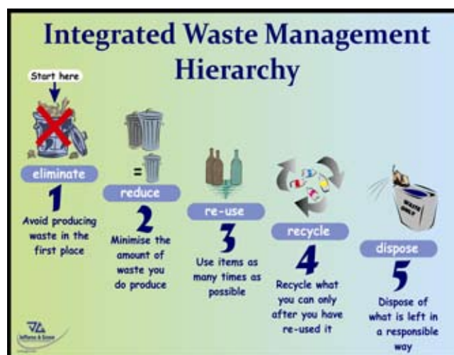
Figure 1: Principles of the Waste Management Hierarchy

Figure 1 provides a graphic illustration of the principles that will be used to promote more sustainable waste management systems within the city of Windhoek.