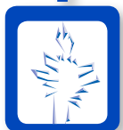
SE: Economic Development and Community Services Vacant