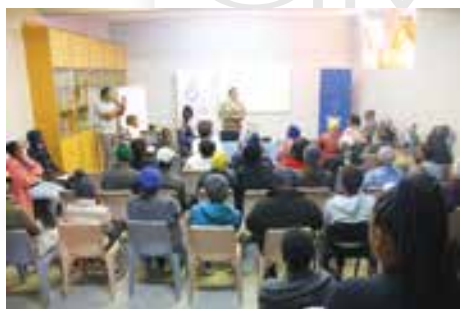
Representatives of the community working group.

The YDT Section hosts workshops in collaboration with multi-community developmental partners including community members/leaders, the Ministry