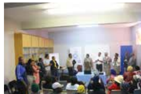
Participants attending the Horticulture Training at Katutura Community Hall on 21 July 2022.