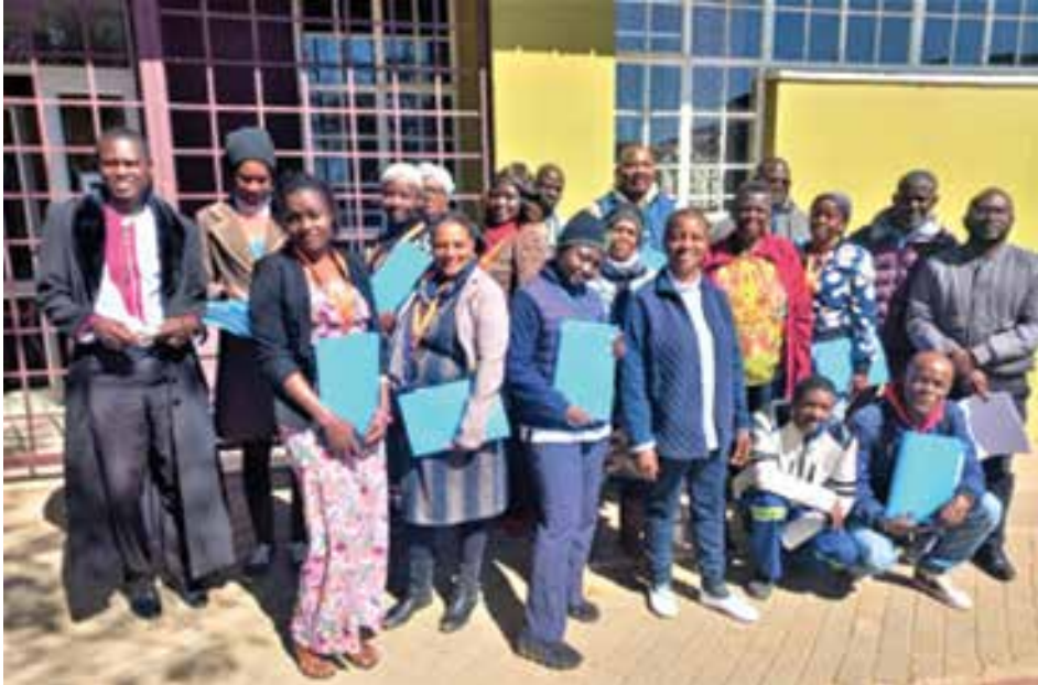
Equipped for growth: Nineteen entrepreneurs took part in the City's "Improve Your Business" training programme from 18 to 21 July at the Oshetu Market in Katutura.