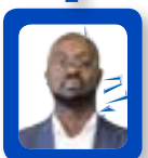
SE: Electricity OA Hekandjo