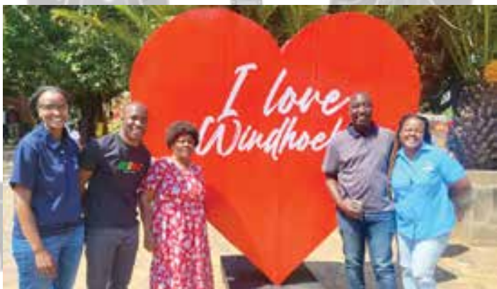
Several City councillors and officials attended the Windhoek Spring Market on 2 and 3 September.