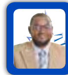
Cllr SS Nujoma (MC) SWAPO