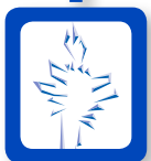
SE: Information and Communication Technology Vacant