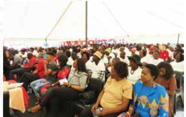
Members of the public listening to various speakers during the commemoration of global hand washing day.