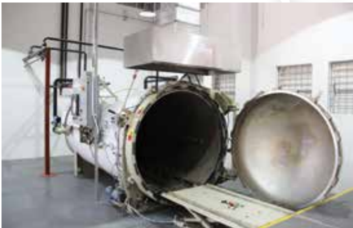
Auto Clave Section of the Health Care Risk Waste Facility.

able to sustainably treat most of the medical waste generated in Windhoek. The facility consists of two methods of medical waste disposal; autoclave technology that does not emit any emissions and the combustible facility. The autoclave part of the facility will cater for about 15% medical chemical waste, that includes some waste that are radioactive, while 85% of the general medical waste will be treated by the combustible incinerator of the facility. Mr. Koujo assured that the facility will combust waste properly with no impact on the environment, and or the health wellbeing of the residents of the nearby suburbs of Katutura and Khomasdal.