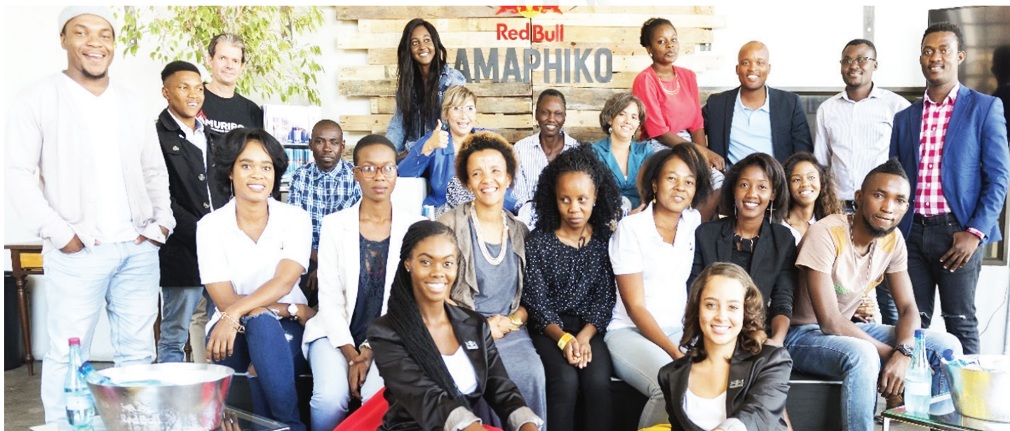
Participants at the recently held entrepreneurial Amaphiko workshop, held in the capital city recently.

On Thursday, 8 March 2018, Red Bull Namibia held a workshop that was attended to about 20 local entrepreneurs in various business fields, with same principal goal of finding solutions to social issues and uplifting the local community by creating jobs. Red Bull Amaphiko is the Zulu word for "Wings" and is a platform created for social entrepreneurs, with the mission to give wings to pioneers who are making use of their talent, creativity and energy to solve social problems and make a difference in a country.