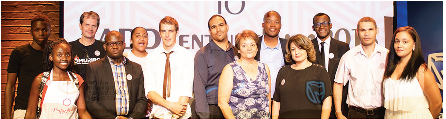
The judges and the pitchers on stage at the Warehouse Theatre

The Deutsche Gesellschaft für Internationale Zusammenarbeit (GIZ) GmbH on behalf of the German Government in collaboration with the Namibia University of Science and Technology's FABI Lab, Standard Bank Enterprise Banking and the City of Windhoek, hosted the ADDVENTURE Pitch Night, on 8 March 2018 at the Warehouse Theatre.