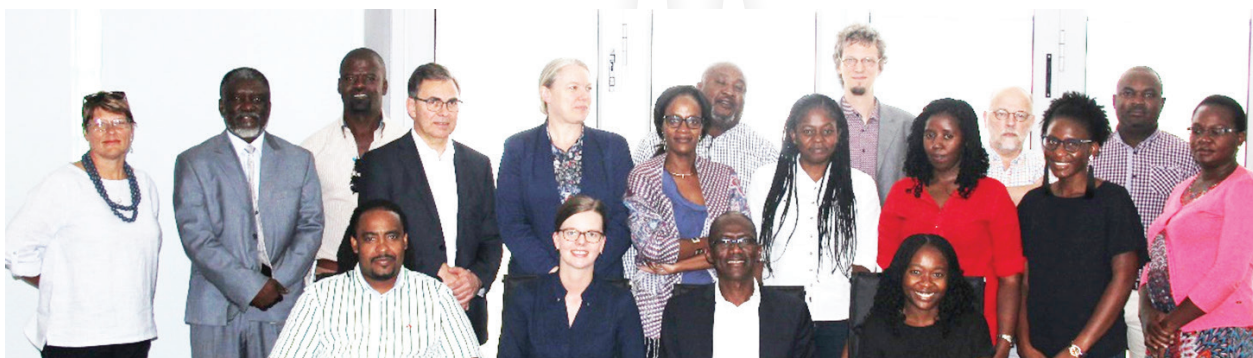
City of Windhoek's technical team pictured with the visiting Bremen team during the technical meetings.

The City held technical meetings during the 2nd week of February this year aimed at learning from the City of Bremen the best practices in environmental management of municipal waste and deriving economic benefits from waste management. The teams also shared technical information that can help the city pave the way towards implementing desired capital projects in the areas of sanitation, renewable energy, waste recycling, and climate change.