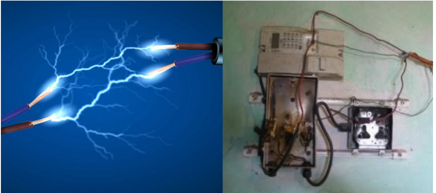
Image illustrating electricity and illegal electricity connections.

Illegal electricity connections lead to electricity accidents of electrocution, death, damage to equipment and in some case fire.