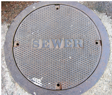
For illustration purpose an image of the sewer manhole cover.

Following incident of sewer manhole cover theft, the City of Windhoek is aware of residents stealing manhole cover for financial profit. The city is appealing to its residents to report anyone