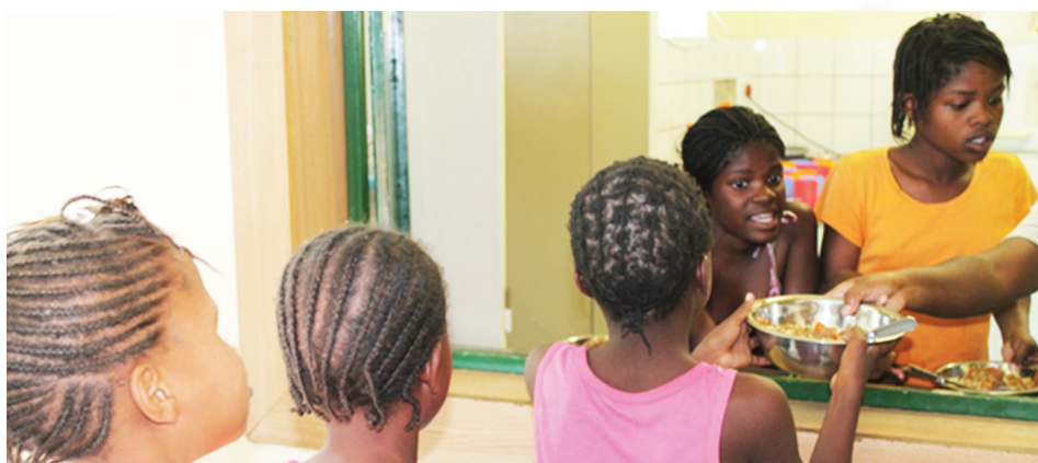
Orphans and Vulnerable children receiving their daily meal