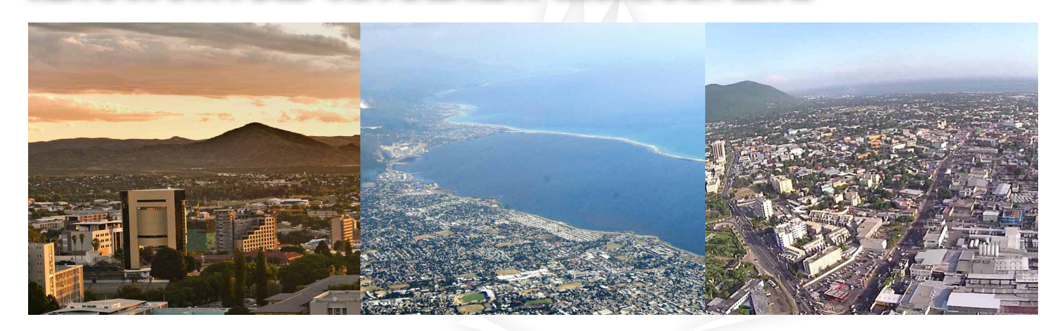
Windhoek Namibia St Andrew Jamaica Kinaston, Jamaica

The twining agreement between Windhoek and the two cities, City of Kingston and St. Andrew of Jamaica, will strengthen bilateral relations between Namibia and Jamaica. The diplomatic discussions on the twining relationship kick stared early last year between the City of Windhoek Mayor 's Office and the Jamaican Consulate in Windhoek, and received further boost with the recent visit by the Most Honourable Andrew Michael Holness Honourable Prime Minister of Jamaica's visit to Namibia.