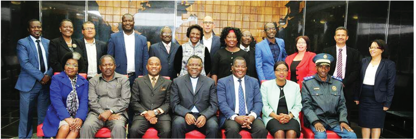
City delegation pictured with the Head of State, His Excellency, Dr. Hage Geingob, Hon. Sophia Shaningwa, Minister of Urban and Rural Development, Hon. Frans Kapofi, Minister of Presidential Affairs and Right Hon. Prime Minister, Saara Kuugongelwa-Amadhila