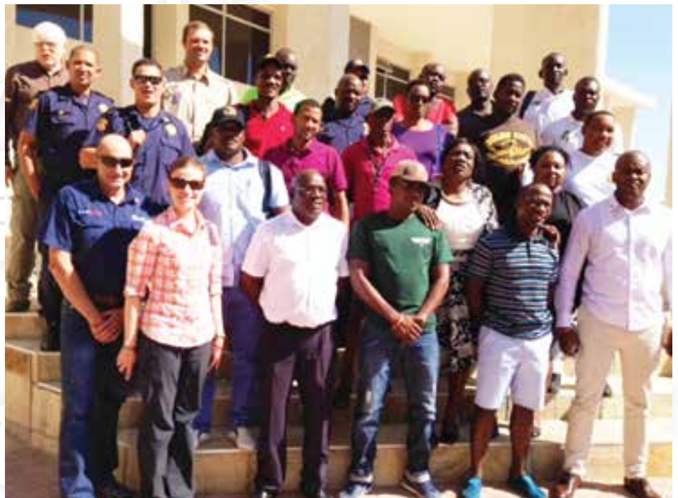
Namibia Incident Command System Class of 2016