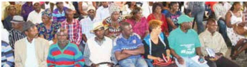
Some Windhoek residents during the launch of 2015 public meetings in Hakahana

While still discussing the pertinent issues to the operations of the City, I would like to caution the residents of Windhoek on the seriousness of the water crisis that hit the Central area in which Windhoek is served