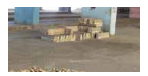
The area earmarked for upgrading