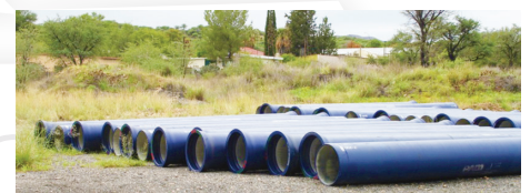
Water pipes at the construction side in Avis for potable water from boreholes.

form part of the longer term strategy for developing the Windhoek Aquifer under the WMARS program. The City's leadership has prioritised the emergency water supply project to connect more boreholes to the water supply network. It should be noted that despite these efforts the water saving measure by the City's residents are still necessary as the aquifers depend on the water recharge as per rain season yields.