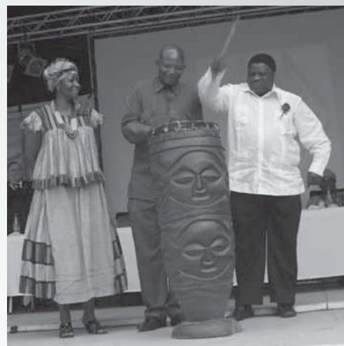
Deputy Mayor, Cllr. Agnes Kafula looking on the Minister for Youth, Sports and Culture, Hon. Kazenambo Kazenambo and the Minister of foreign Affairs Utoni Nujoma beat the drums, signifying the official opening of the 2010 /Ae //Gams festival activities