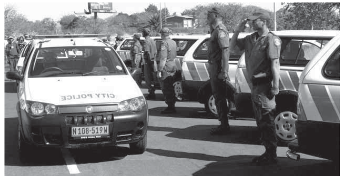
Members of the City Police Service taking the salute as Deputy Mayor Cllr. Agnes Kafula drive pass during the handing over ceremony.