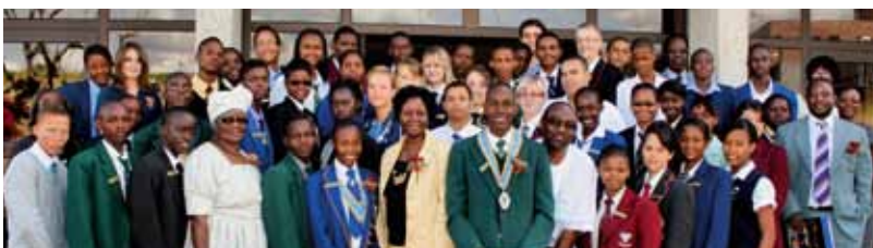
Junior Council 2010 with some of the Officials

collaboration with the City of Windhoek, Hospitality Association of Namibia, Namibia Tourism Board and F.N.B.