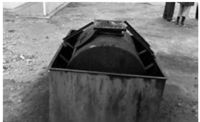
Used Oil Collection Tank at Katutura Industrial Stalls, Hostel Street Katutura