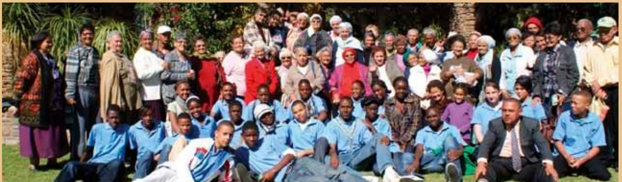
Senior Citizens with the Junior Councillors in Parliament Garden, Saturday 19 June 2010