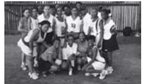
One of the games won by the City against Keetmanshoop Municipality

THE Namibia Local Authority Sports and Recreation Association (NALASRA) recently held the inter-municipal games in Keetmanshoop under the theme 'Play Safe' a theme dedicated towards the fight against HIV-AIDS. At the occasion, the City of Windhoek proudly walked away with several medals including Overall winner, a title they shared with Walvisbaai Municipality.