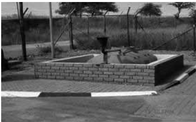
Used oil Collection Tank at Bulk and Waste Water Division, Pullman Street, Windhoek North