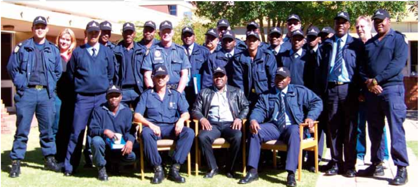
Members of the Emergency Management who attended the Advance Fire Prevention Course Presented by the Fire Prevention Association of Southern Africa (FPASA) from 14 June to 24 June 2010 with the two instructors in their mist.

Others found the course informative and innovative, they recognized the importance of fire prevention strategies compared to traditional fire fighting. The course encouraged them to implement best fire prevention practice during the normal duties.