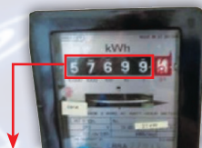
Read only the 5 white digits